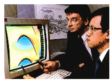
SOFTWARE TO DESIGN JET TURBINE includes a genetic algorithm that combines the best features of designs produced by other programs. Engineers using the algorithm achieved better results than with more conventional software aids.

The design of a turbine involves at least 100 variables, each of which can take on a different range of values. The resulting search space contains more than 10^{387} points. The "fitness" of the turbine depends on how well it satisfies a series of 50 or so constraints, such as the smooth shape of its inner and outer walls or the pressure, velocity and turbulence of the flow at various points inside the cylinder. Evaluating a single design requires running an engine simulation that takes about 30 seconds on a typical engineering workstation.