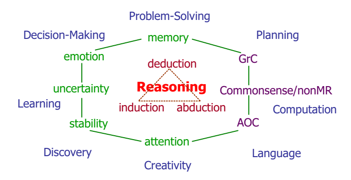
Fig. 2. Reasoning centric thinking oriented functions and their relationships (GrC: Granular Computing [25]; AOC: Autonomy Oriented Computing [14]; nonMR: non-monotonous reasoning)